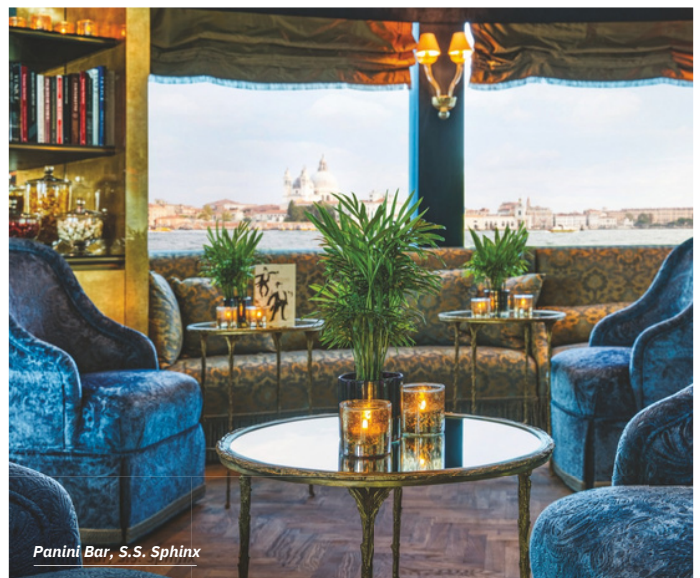
Panini Bar, S.S. Sphinx

As your water taxi glides past narrow side canals and the Canal Grande, you'll arrive in style at the Rialto Bridge and Fondaco dei Tedeschi. The iconic stone arch bridge sits at the narrowest point of the Canal Grande and holds numerous shops and restaurants.